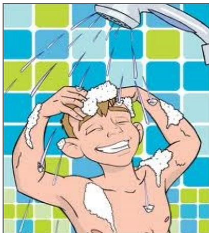
Hygiene and healthy bodies