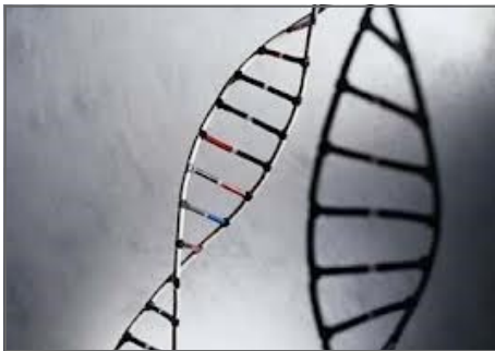
Heredity in Science