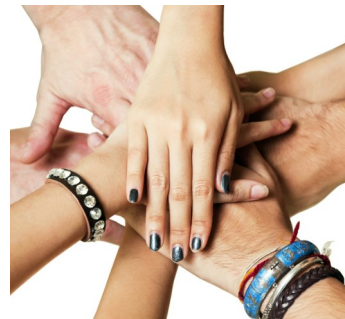
Friendship and relationships