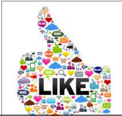
Internet safety and influence of the media